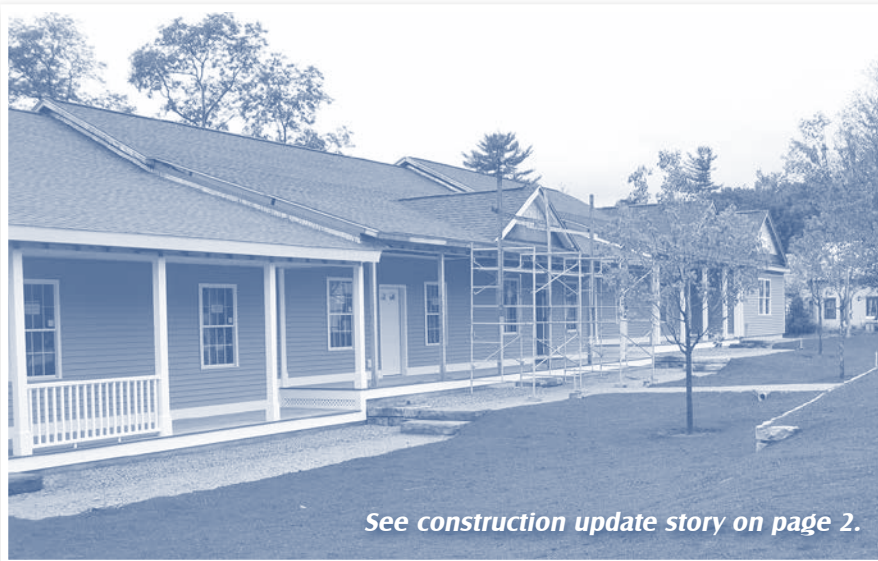
See construction update story on page 2.

A s we continue to work on the North Road condominiums, we are looking for new families to apply to live in the units. We are asking for your help to reach families interested in purchasing a new Habitat home who may need help to qualify for a mortgage and are willing to work with Habitat to build their future.