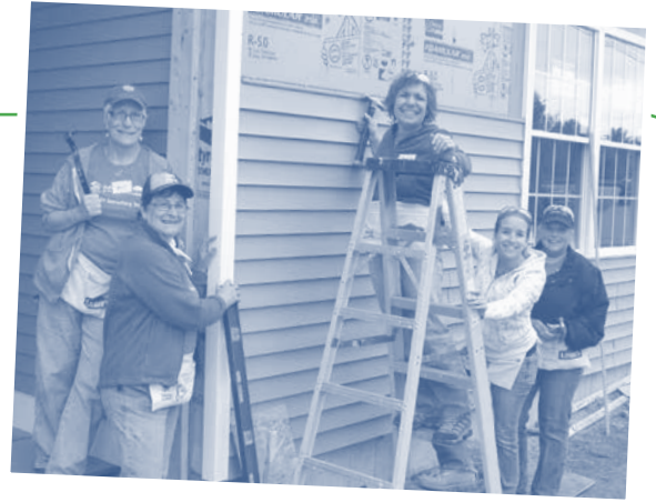
Part of the Women Build team working on the North Road construction.

The progress has steadily moved forward since then. The size and scope of the project is a challenge. This is not a typical Habitat ranch style house – North Road is a 6000 square foot - 4 unit building. On the outside, we have installed retaining walls, stairs, walkways, parking, and landscaping. Our electricians have installed exterior lighting and are currently starting the interior electrical service. Carpentry crews are finishing the exterior including a beautiful front porch area, complete with columns and railings.